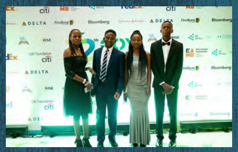
HEKIMA INC, ZIMBABWE TOMORROW FOUNDATION FUTURE TECH AWARD WINNERS