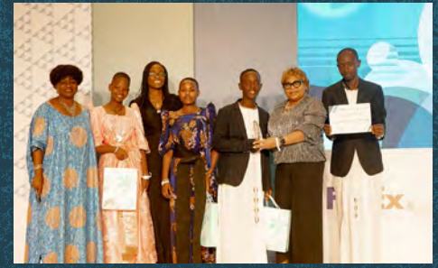
CITI MULT-TECH STARS, UGANDA DELTA SOCIAL IMPACT AWARD WINNERS