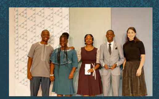
KIBEGA, TANZANIA CHANGEMAKER AWARD BY BLOOMBERG WINNERS