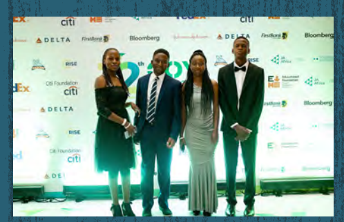
HEKIMA INC, ZIMBABWE GRAND PRIZE WINNERS