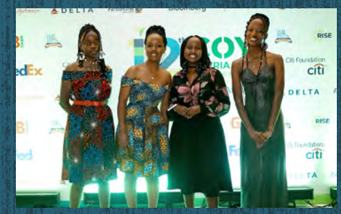
AQUATECH, KENYA NASCON ENTREPRENEURIAL EXCELLENCE AWARD WINNERS