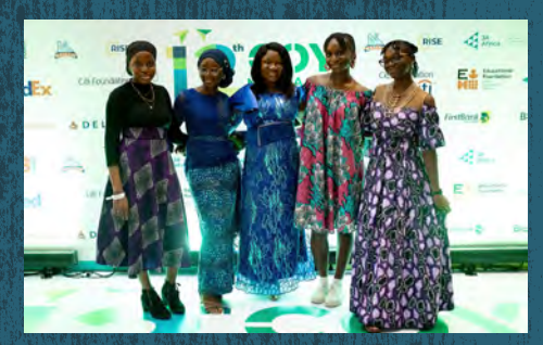
GREEN APEX, NIGERIA 2ND PRIZE WINNERS