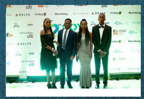
HEKIMA INC, ZIMBABWE PMIEF OUTSTANDING PROJECT MANAGENMENT AWARD WINNERS