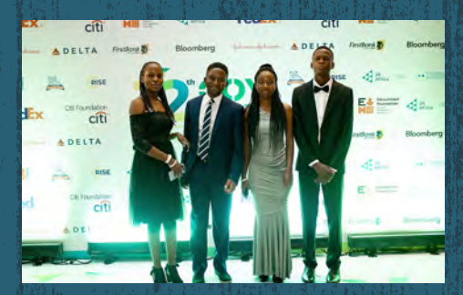
HEKIMA INC, ZIMBABWE RISE AWARD WINNERS