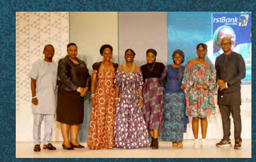
GREEN APEX, NIGERIA FIRSTBANK FUTURE FIRST AWARD FOR FINANCE WINNERS