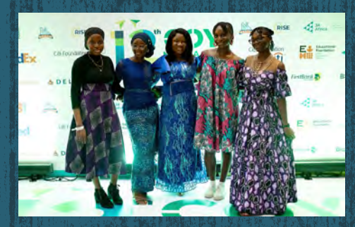
GREEN APEX, NIGERIA J&J INNOVATION AWARD WINNERS