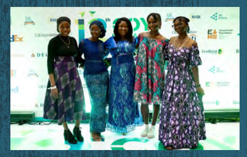
GREEN APEX, NIGERIA PUBLIC CHOICE AWARD WINNERS